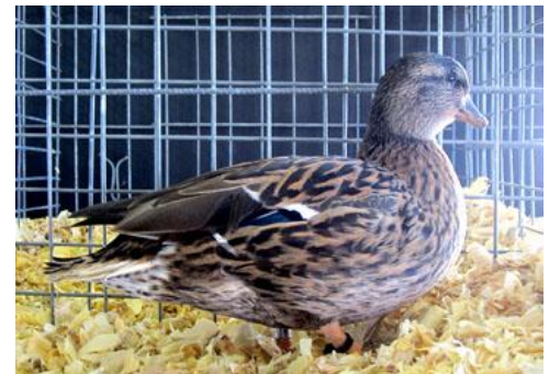
Reserve Champion Bantam Duck - Show Two ~ Gray Call Old Duck, by Jim & Patti Zimmerman.