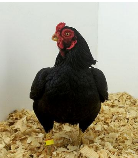
Show 2: Champion AOCCL & Show 1: Reserve Champion AOCCL - Dark Cornish Cockerel - Owned by Jerry McCarty.