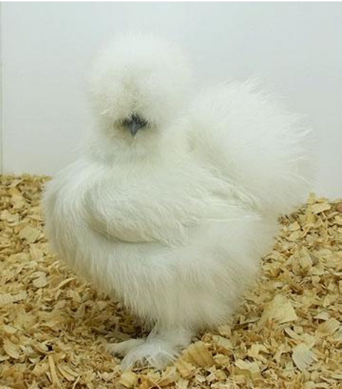
Show 1: Reserve Champion Bantam. BOTH shows: Champion Feather Leg: Bearded White Silkie - Owned by Sherri Humphries.