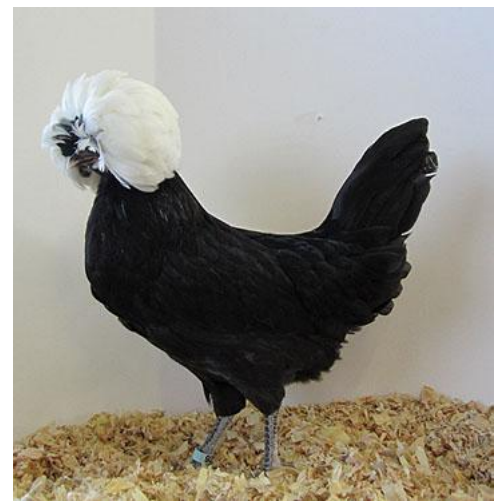
Reserve Show Champion - Junior Show 2 - White Crested Black Polish Pullet shown by Dodge Cowart .

Featherleg ~ Black Cochon Cock, by Will Bryles. Reserve ~ Black Cochon Hen, by Will Bryles