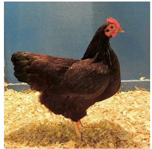
Champion SCCL - Show 2 ~ Rhode Island Red Pullet, by Jacob Bates.