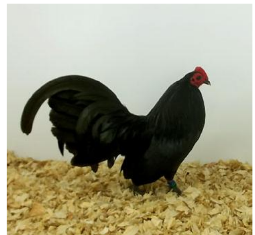
Grand Champion of Show 2: Black OEGB Cockerel exhibited by Kasey Smith

Grand Champion of Show 2: Black OEGB by Kasey Smith. Res. Grand Champ: Rhode Island Red by Matt Ulrich.