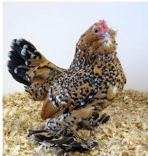
On The Cover . . . Pictured is the Reserve Champion Bantam (Show 1) at Fayetteville, Arkansas on September 28, 2013 - a Millie Fleur Belgian D'ucle Hen exhibited by Broken Feather Bantams.