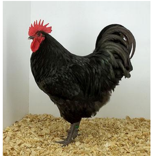
Show 1: Res. Grand Champion of Show & Champion English in Show 2 - Black Australorp cockerel - Owned by Matt Ulrich.