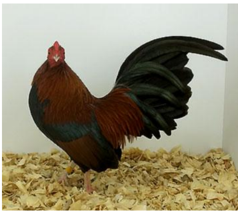
Show 1: Champion OEG, BB Red Cockerel - owned by Dwight Bordere.