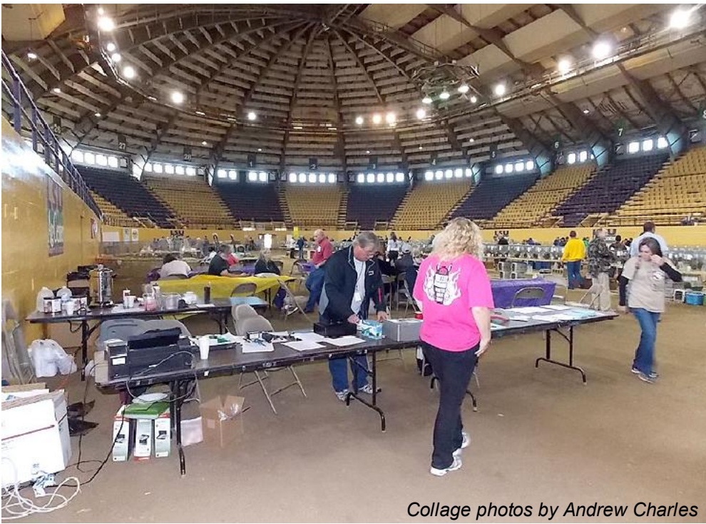
Collage photos by Andrew Charles