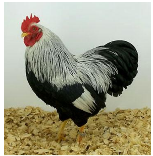
Junior Show Grand Champion and Ch. Bantam : Silver Penciled Plymouth Rock shown by Tre Tuttle.