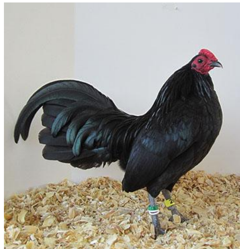
Reserve Champion OEG - BOTH shows. Black Old English Cockerel, by Ned Simmons.

SCCL ~ Rhode Island Red Pullet, by Jacob Bates. Reserve ~ White Japanese Hen, by