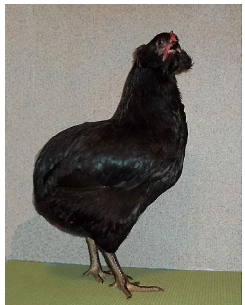
Show 2 - Reserve Champion Large Fowl. BOTH Shows: Champion AOSB - Black Araucana Pullet - Owned by Ann Charles