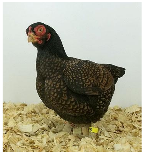
Show 1: Champion AOCCL & Show 2: Reserve Ch. AOCCL - Dark Cornish Hen - Owned by LF DeRouen.