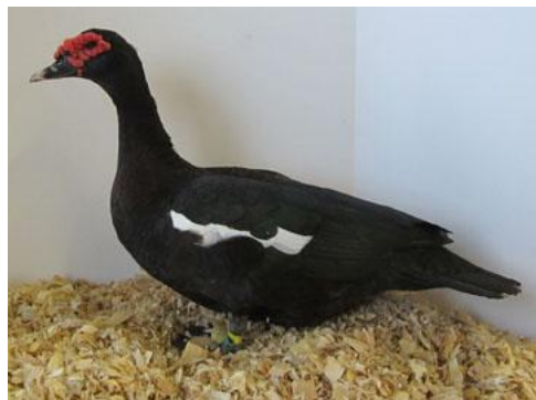
Champion Waterfowl - Show 2 & Reserve Champion Waterfowl - Show 1 ~ Black Muscovy Old Duck, by Jacob Bates.

Heavy Goose ~ Brown African Old Gander, by Jacob Bates. Reserve ~ White Embden Old Goose, by Melinda & Danny Akehurst.