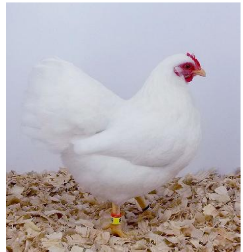
Grand Champion of Show 1 and Champion SCCL of Show 2 was a White Rock Pullet exhibited by Jerry McCarty.

Grand Champion of Show 1: White Rock Pullet by Jerry McCarty. Reserve Grand Champ Show 1: Black Australorp by Matt Ulrich