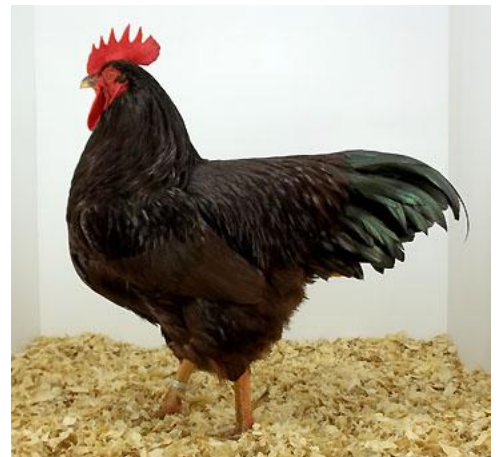
Show 2: Champion LARGE FOWL& Champion American BOTH Shows - a Rhode Island Red Cuck - Owned by Matt Ulrich.